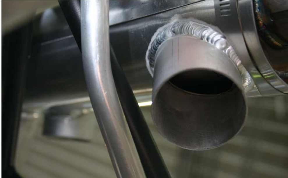
FIGURE 2 – Close View of Clearance Required

Cub Crafters, Inc. Considers Compliance Mandatory August 25, 2009 The parts of this Service Bulletin that change the Type Design of the aircraft have been approved by the FAA.